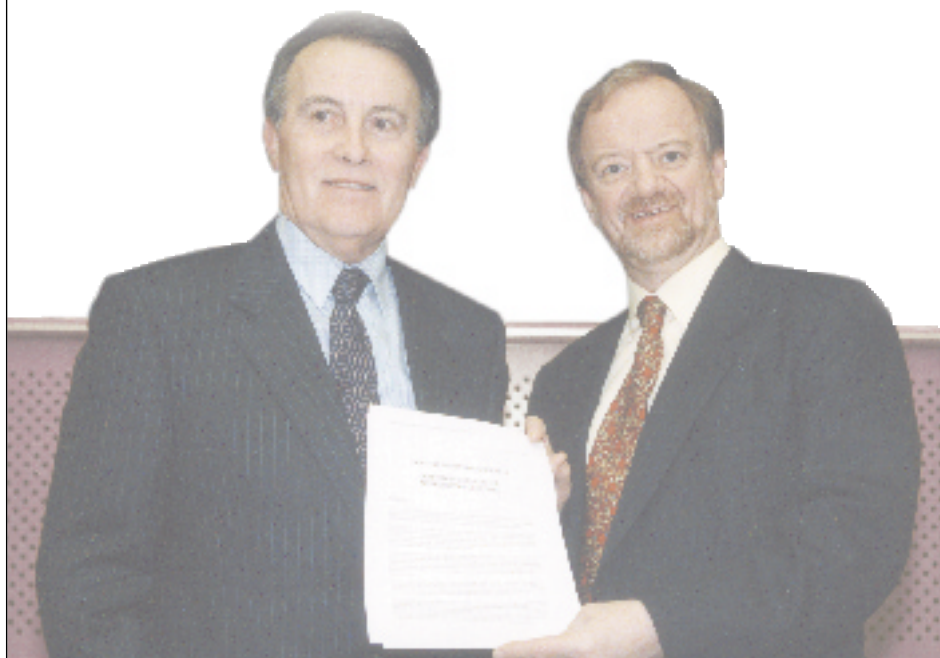
Robin Cook and Henri Nallet - Chair and Vice-Chair of the PES Manifesto Working Party