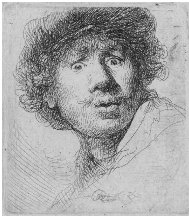
Figure 1. Rembrandt Harmensz. van Rijn. Self-portrait with beret, wide-eyed (1630).

The British journalist Matt Ridley once offered the following semi-serious definition of prosperity 54 : 'Prosperity is a reduction in the time it takes to fulfil a need.'